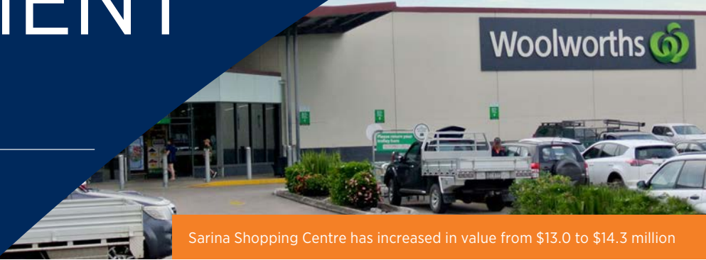
Sarina Shopping Centre has increased in value from $13.0 to $14.3 million

We are pleased to provide you with an update to the Product Disclosure Statement (PDS) of the MPG Retail Brands Property Trust (ARSN 122 578 741) (Trust) dated 1 October 2007. This Investment Update is issued by MPG Funds Management Ltd (MPG or RE) (AFSL 227114, ACN 102 843 809) in its capacity as Responsible Entity for the Trust and should be read in conjunction with the PDS.