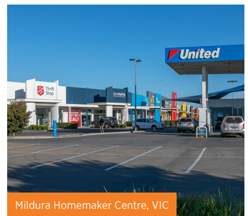
Mildura Homemaker Centre, VIC