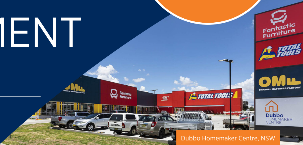
Dubbo Homemaker Centre, NSW

MPG Bulky Goods Retail Trust ARSN: 105 947 199