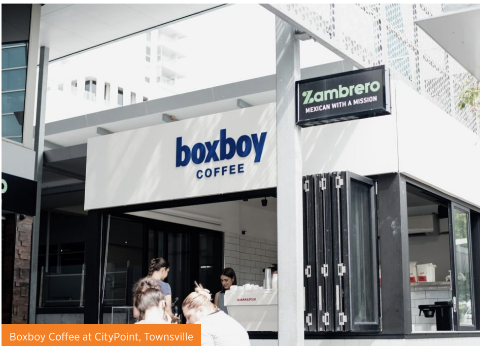
Boxboy Coffee at CityPoint, Townsville

The Trust continues to perform to expectations and contains 22 properties that are 96% occupied and predominately leased to government tenants.