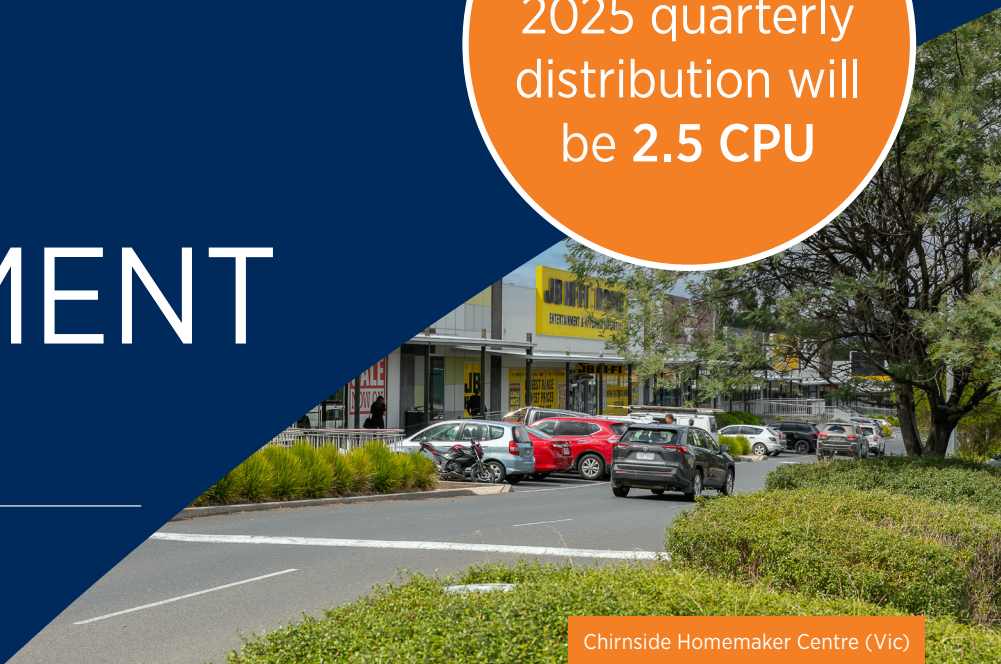
Chirnside Homemaker Centre (Vic)

December 2025 quarterly distribution will be 2.5 CPU