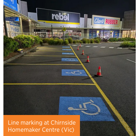
Line marking at Chirnside Homemaker Centre (Vic)

The distribution for the December 2025 quarter will be 2.5 cents per unit. The forecast return for the financial year ended 30 June 2026 is anticipated to be 10.00 1 cents per unit.