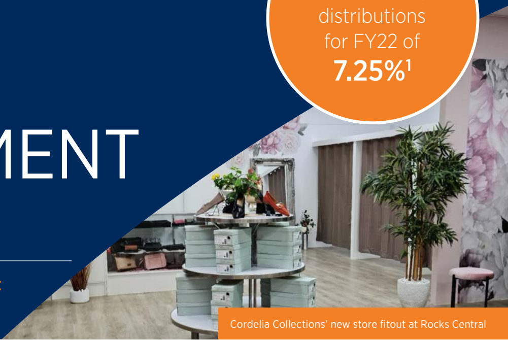
Cordelia Collections' new store fitout at Rocks Central

We are pleased to provide you with an update to the Product Disclosure Statement (PDS) of the MPG Retail Brands Property Trust (ARSN 122 578 741) (Trust) dated 1 October 2007. This Investment Update is issued by MPG Funds Management Ltd (MPG or RE) (AFSL 227114, ACN 102 843 809) in its capacity as Responsible Entity for the Trust and should be read in conjunction with the PDS.