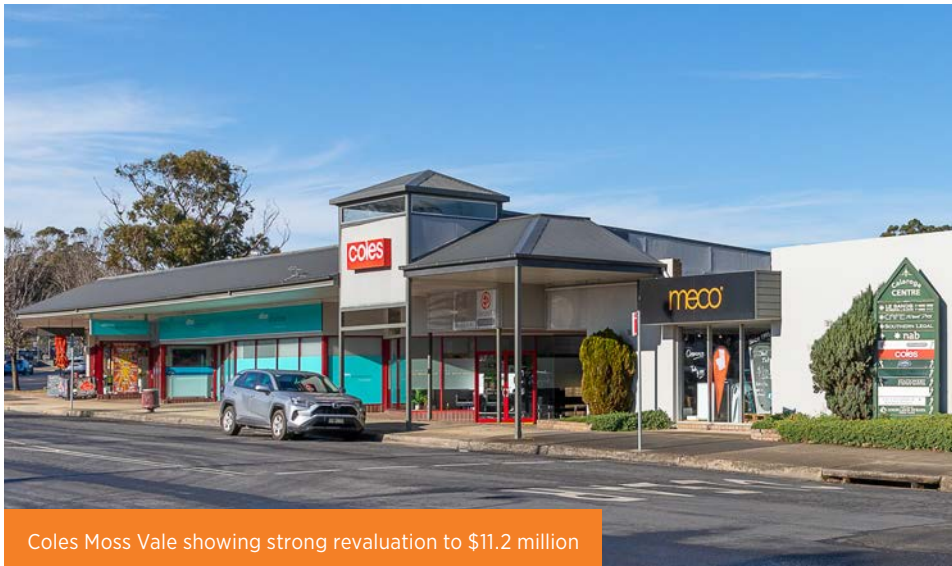
Coles Moss Vale showing strong revaluation to $11.2 million

The distribution for the March 2022 quarter will be 1.8125 cents per unit.