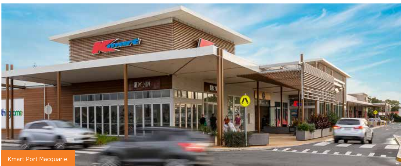
Kmart Port Macquarie.

This Trust, which was available to Wholesale investors and contains a 7,037 sqm (GLA) Kmart store and 1,089 sqm of complimentary retail space, located in Port Macquarie, NSW.