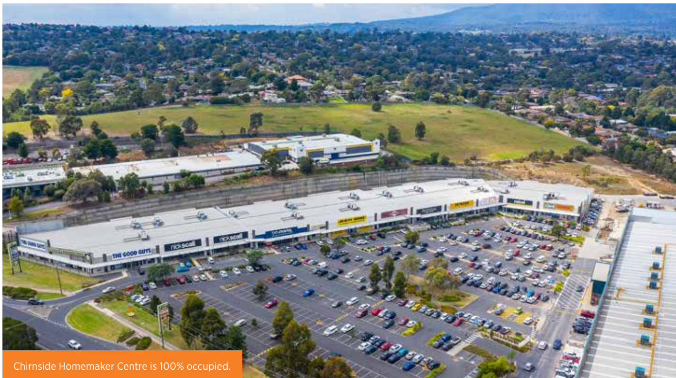
Chirside Homemaker Centre is 100% occupied.

This Trust contains two Homemaker Centres located in Chirside Park (Vic) and Mildura (Vic).