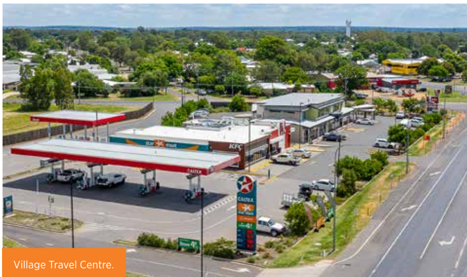
Village Travel Centre.

This Trust which was available to Wholesale investors contains a 1,691 sqm petrol and fast food convenience service centre located in Chinchilla, Queensland.