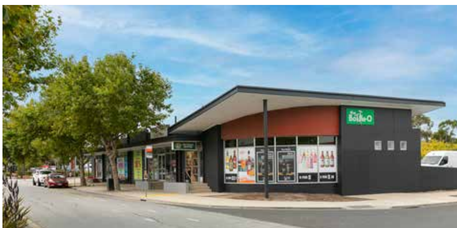
Village Lakeside Shopping Centre - Value add refurbishment works and valuation increase to $23.25 million.

The properties contained in the Trust are 98% occupied and is targeting a 7.25 cents per unit distribution target for the financial year ending 30 June 2022 1 .