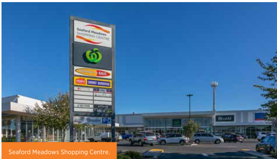
Seaford Meadows Shopping Centre.

We have seen this growth reflected in the increased Woolworths supermarket sales turnover and foot traffic counts at the Centre.