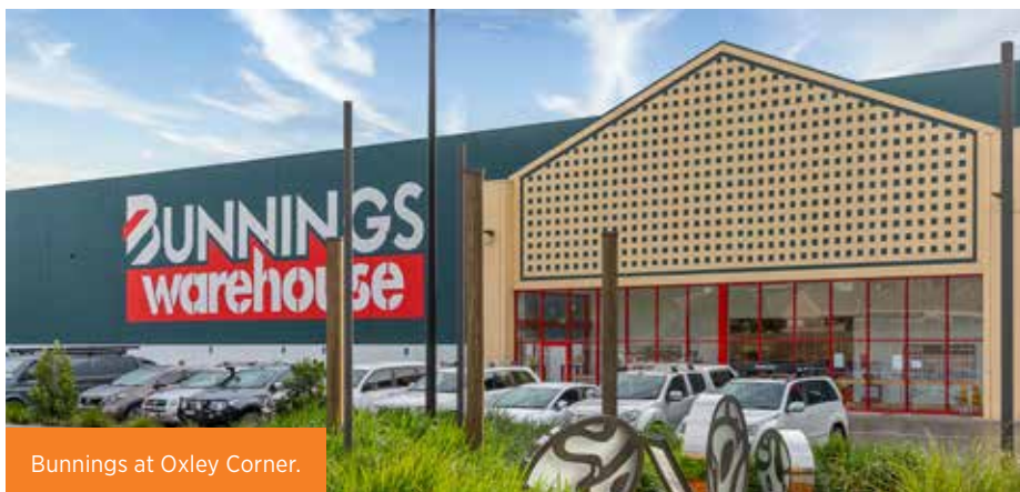
Bunnings at Oxley Corner.

This Trust which was available to Wholesale investors contains a new 18,407 sqm Bunnings Warehouse facility, with 2,400 sqm of additional specialty tenancies, located in the growing region of Port Macquarie in New South Wales.