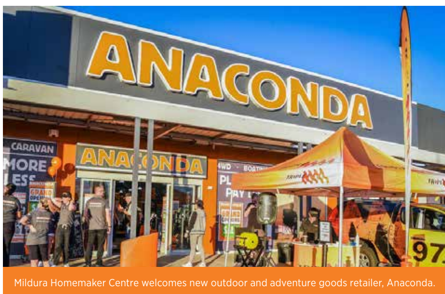
Mildura Homemaker Centre welcomes new outdoor and adventure goods retailer, Anaconda.

At the Mildura Homemaker Centre we are delighted to welcome outdoor and adventure goods retailer, Anaconda as well as mattress superstore, OMF (Original Mattress Factory) who have both entered into new leases. We are also pleased to confirm that United Petroleum has renewed their lease for