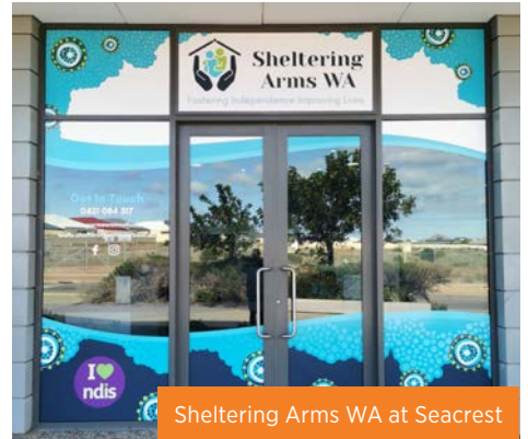
Sheltering Arms WA at Seacrest

The distribution for the June 2023 quarter will be 1.75 cents per unit.