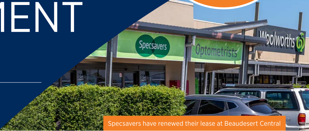
Specsavers have renewed their lease at Beaudesert Central

MPG Retail Brands Property Trust ARSN: 122 578 741