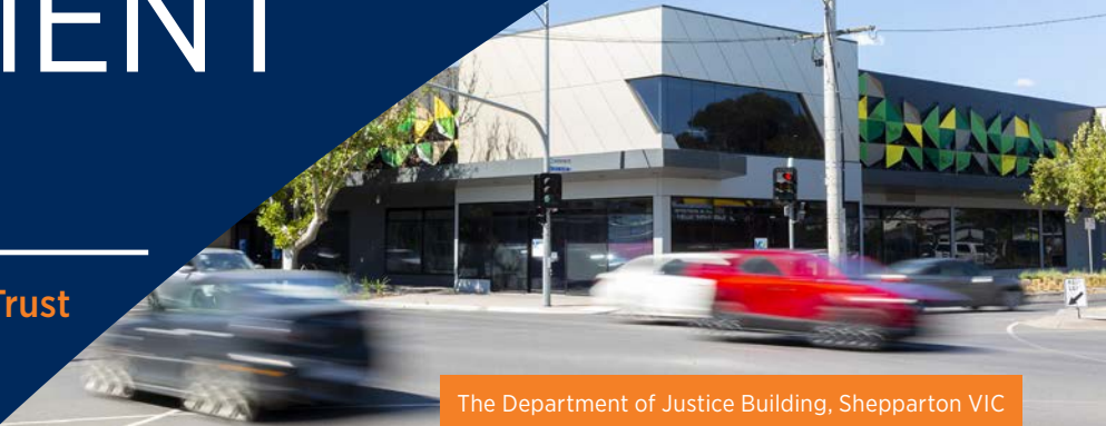
The Department of Justice Building, Shepparton VIC

MPG Essential Services Property Trust ARSN: 160 633 205