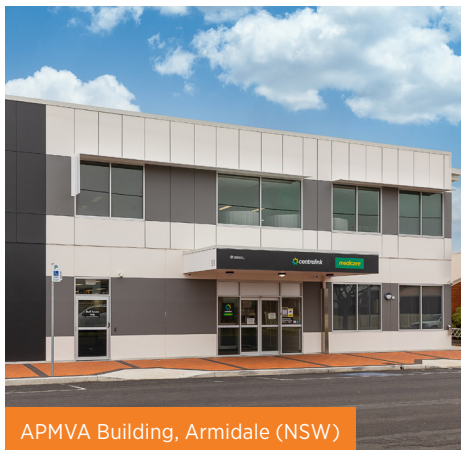
APMVA Building, Armidale (NSW)