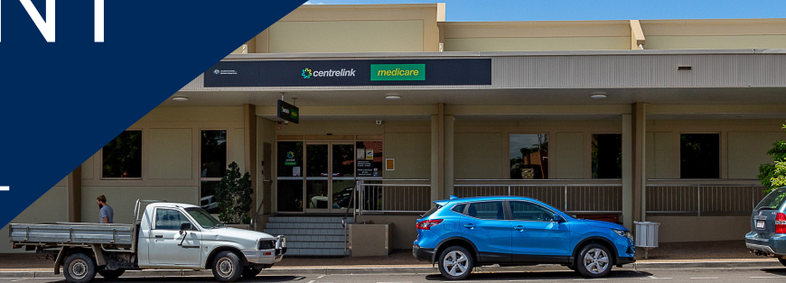
Centrelink, Maryborough (Qld)

The Distribution for FY26 will be 6.25% 1