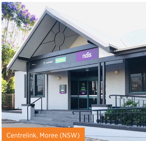
Centrelink, Moree (NSW)