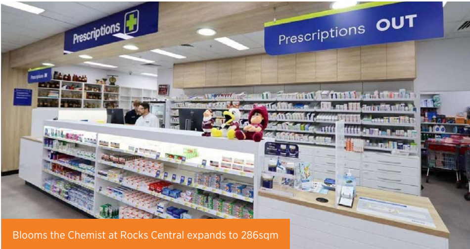
Blooms the Chemist at Rocks Central expands to 286sqm

The distribution for the December 2022 quarter will be 1.75 cents per unit.