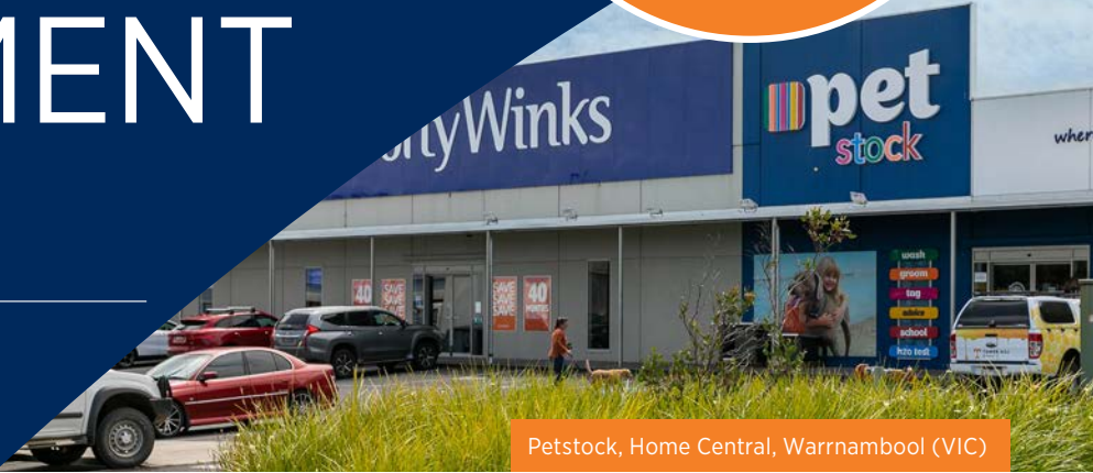
Petstock, Home Central, Warrnambool (VIC)

March 2026 quarterly distribution is 1.5 CPU