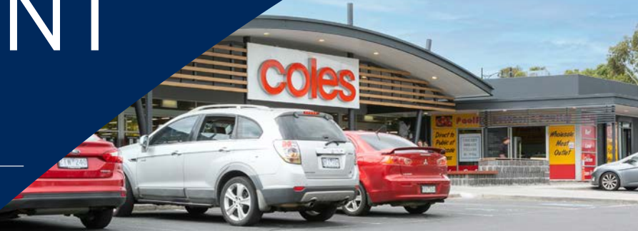
Village Lakeside, Pakenham VIC

We are pleased to provide you with an update to the Product Disclosure Statement (PDS) of the MPG Retail Brands Property Trust (ARSN 122 578 741) (Trust) dated 1 October 2007. This Investment Update is issued by MPG Funds Management Ltd (MPG or RE) (AFSL 227114, ACN 102 843 809) in its capacity as Responsible Entity for the Trust and should be read in conjunction with the PDS.