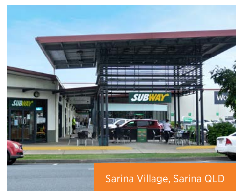
Sarina Village, Sarina QLD