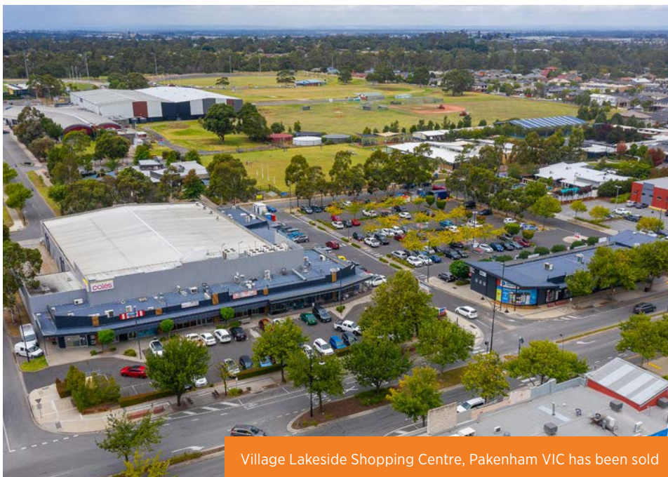
Village Lakeside Shopping Centre, Pakenham VIC has been sold

The distribution for the March 2023 quarter will be 1.75 cents per unit.