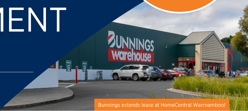
Bunnings extends lease at HomeCentral Warrnambool

Lease extensions and solar installations.