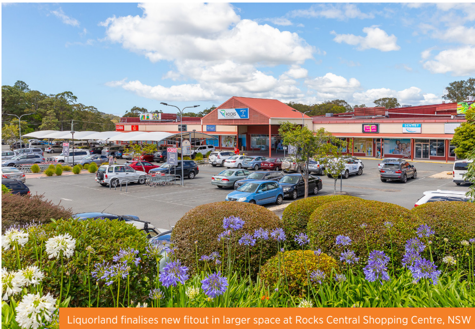
Liquorland finalises new fitout in larger space at Rocks Central Shopping Centre, NSW

The distribution for the March 2024 quarter will be 1.69 cents per unit.