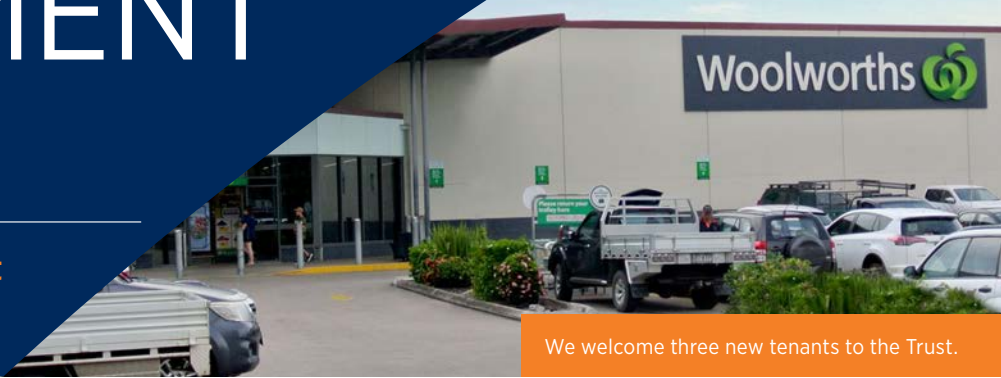
We welcome three new tenants to the Trust.

MPG Retail Brands Property Trust ARSN: 122 578 741