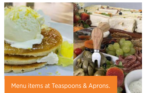
Menu items at Teaspoons & Aprons.