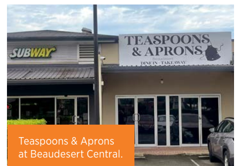
Teaspoons & Aprons at Beaudesert Central.