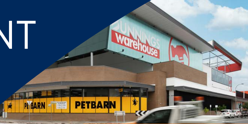
Bunnings Warehouse and Petbarn at Newstead, QLD.

We are pleased to provide you with an update to the Information Memorandum (IM) of the MPG BW Newstead Trust (Trust) dated 9 December 2016. This Investment Update is issued by MPG Funds Management Ltd (MPG) (AFSL 227114, ACN 102 843 809) in its capacity as Trustee for the Trust and should be read in conjunction with the IM.