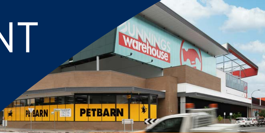
Bunnings Warehouse and Petbarn at Newstead, QLD.

We are pleased to provide you with an update to the Information Memorandum (IM) of the MPG BW Newstead Trust (Trust) dated 9 December 2016. This Investment Update is issued by MPG Funds Management Ltd (MPG) (AFSL 227114, ACN 102 843 809) in its capacity as Trustee for the Trust and should be read in conjunction with the IM.