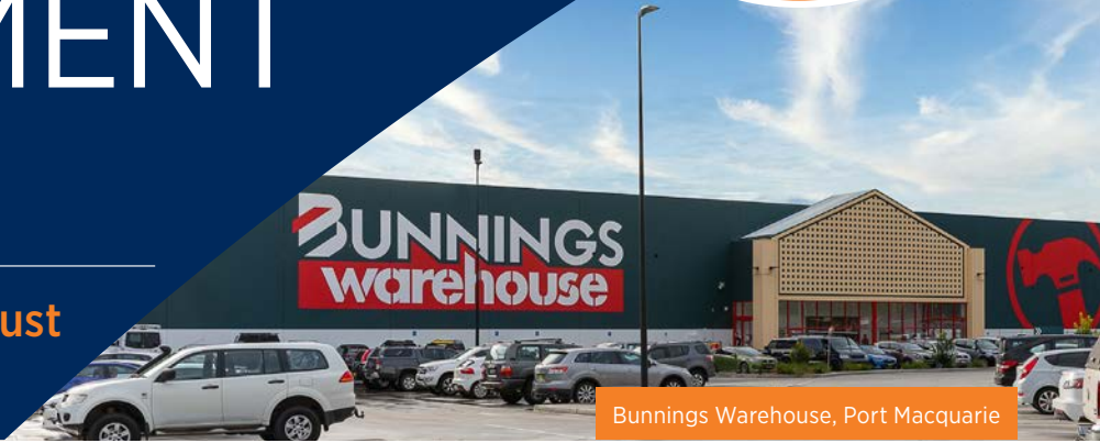
Bunnings Warehouse, Port Macquarie

The property remains fully let and is trading to expectations.