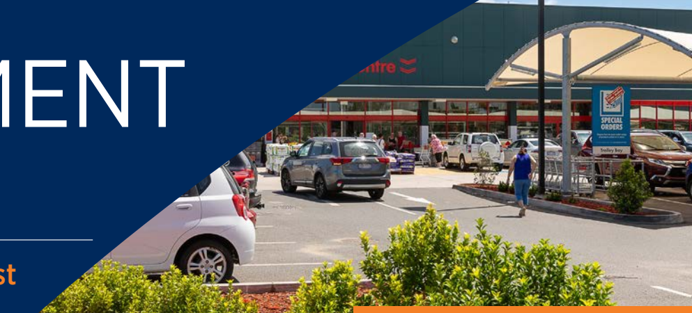
Bunnings Warehouse at Rockhampton Place.

We are pleased to provide you with an update to the Information Memorandum (IM) of the MPG BW Rockhampton Trust (Trust) dated 22 July 2019. This Investment Update is issued by MPG Funds Management Ltd (MPG) (AFSL 227114, ACN 102 843 809) in its capacity as Trustee for the Trust and should be read in conjunction with the IM.