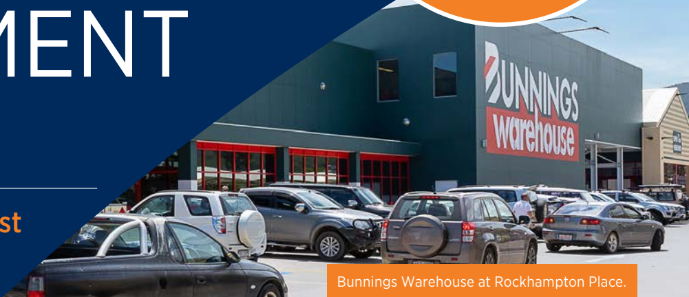
Bunnings Warehouse at Rockhampton Place.

The property remains fully let and is trading to expectations.