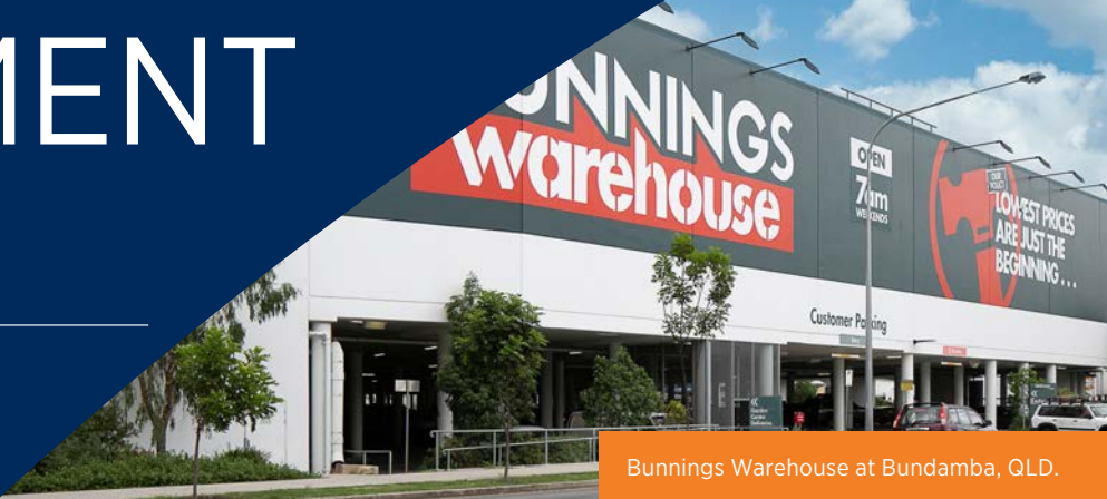
Bunnings Warehouse at Bundamba, QLD.

We are pleased to provide you with an update to the Information Memorandum (IM) of the MPG BW Trust 2 (Trust) dated 28 November 2014. This Investment Update is issued by MPG Funds Management Ltd (MPG) (AFSL 227114, ACN 102 843 809) in its capacity as Trustee for the Trust and should be read in conjunction with the IM.