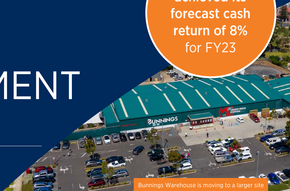
Bunnings Warehouse is moving to a larger site

We are pleased to provide you with an update to the Information Memorandum (IM) of the MPG Hardware Trust (Trust) dated 8 August 2011. This Investment Update is issued by MPG Funds Management Ltd (MPG) (AFSL 227114, ACN 102 843 809) in its capacity as Trustee for the Trust and should be read in conjunction with the IM.