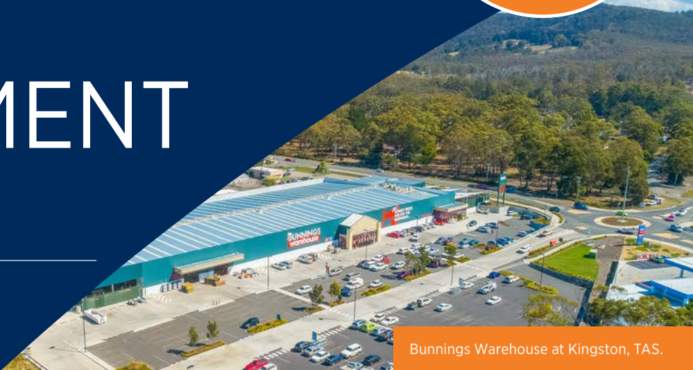
Bunnings Warehouse at Kingston, TAS.

Bunnings Kingston's NTA has increased from $1.33 to $1.67 per unit as at 30 June 2021