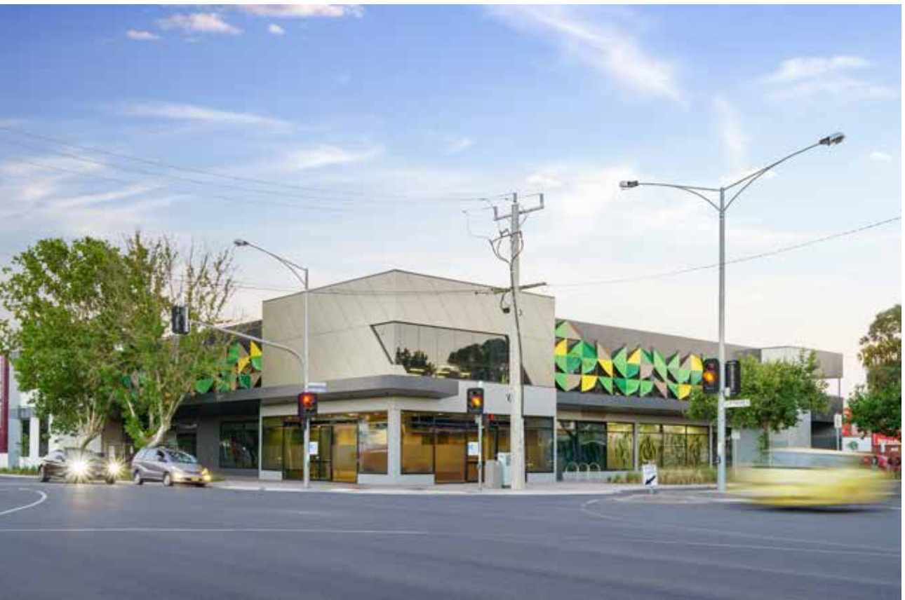
Dept. of Justice and Court Services, Shepparton VIC