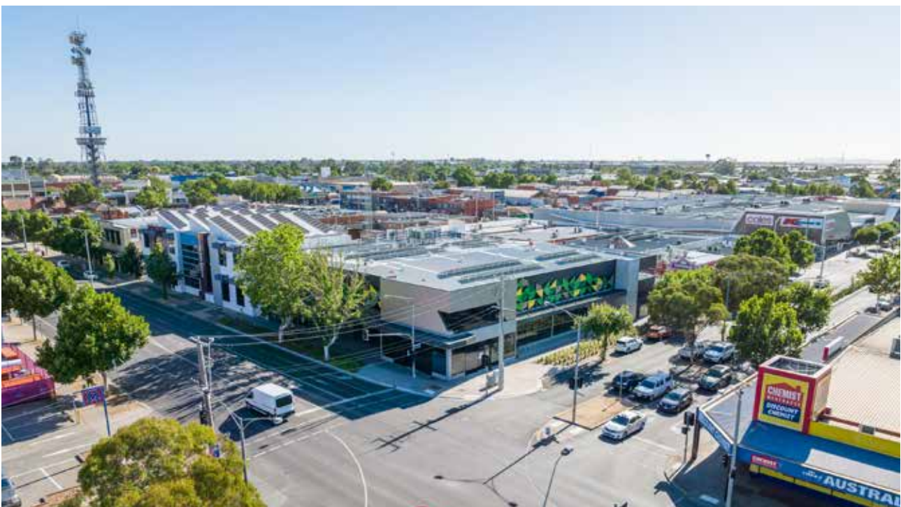
Dept. of Justice and Court Services, Shepparton VIC - A property held in the MPG Essential Services Property Trust

The Trustee will provide each Investor with a tax statement containing information required to complete the Investor's tax return within three months of year end.