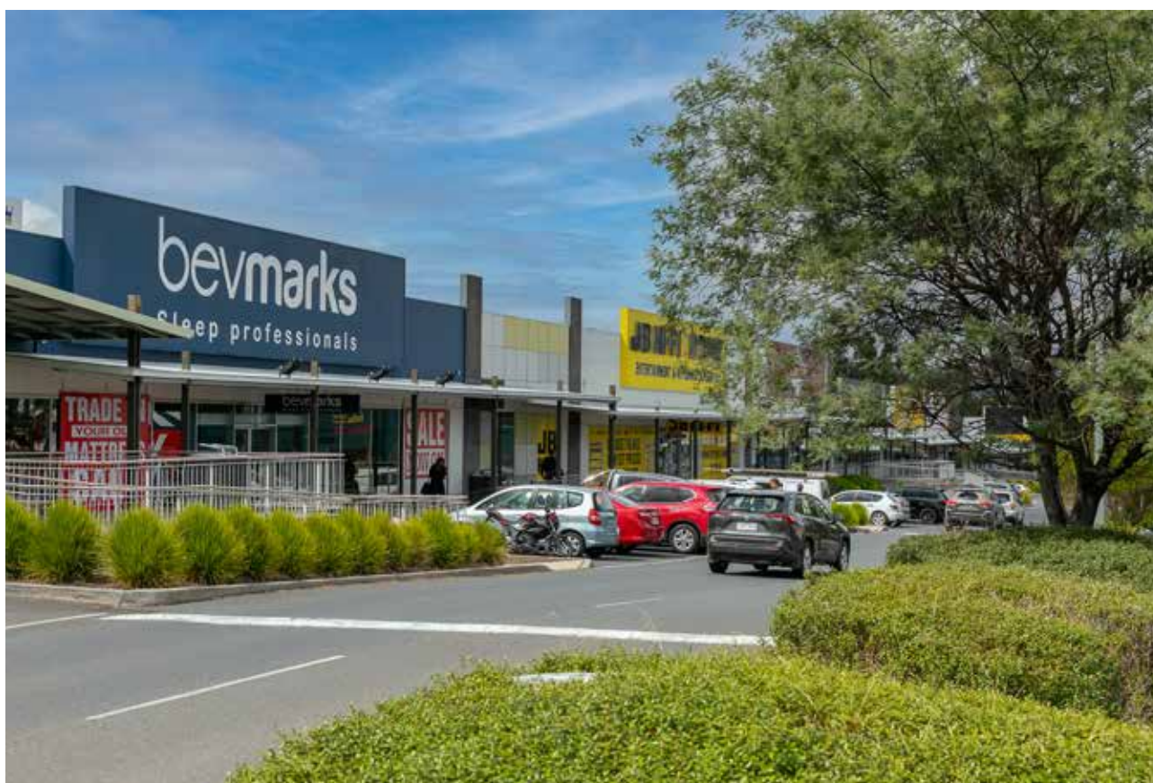
Chirside Homemaker Centre, Chirside Park VIC - A property held in the MPG Bulky Goods Retail Trust

In 2013, MPG was the winner of the IAIR Award for Excellence in Property Investment Management/Boutique in Australia.