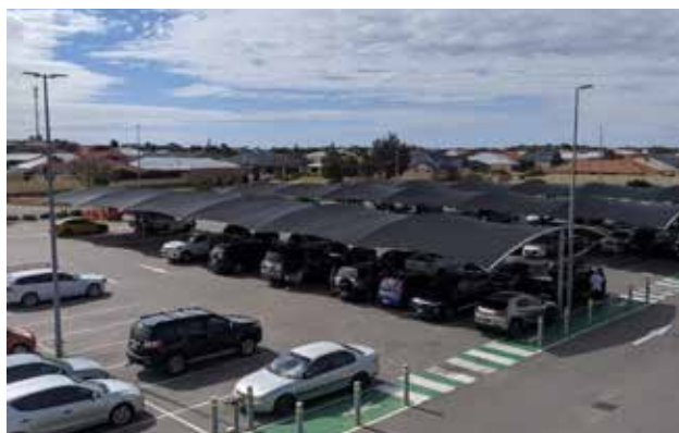
Seacrest Shopping Centre, Wandina WA

A description of these Trusts and other Trusts managed by MPG the may be included in the portfolio in the future may include but are not limited to the following: