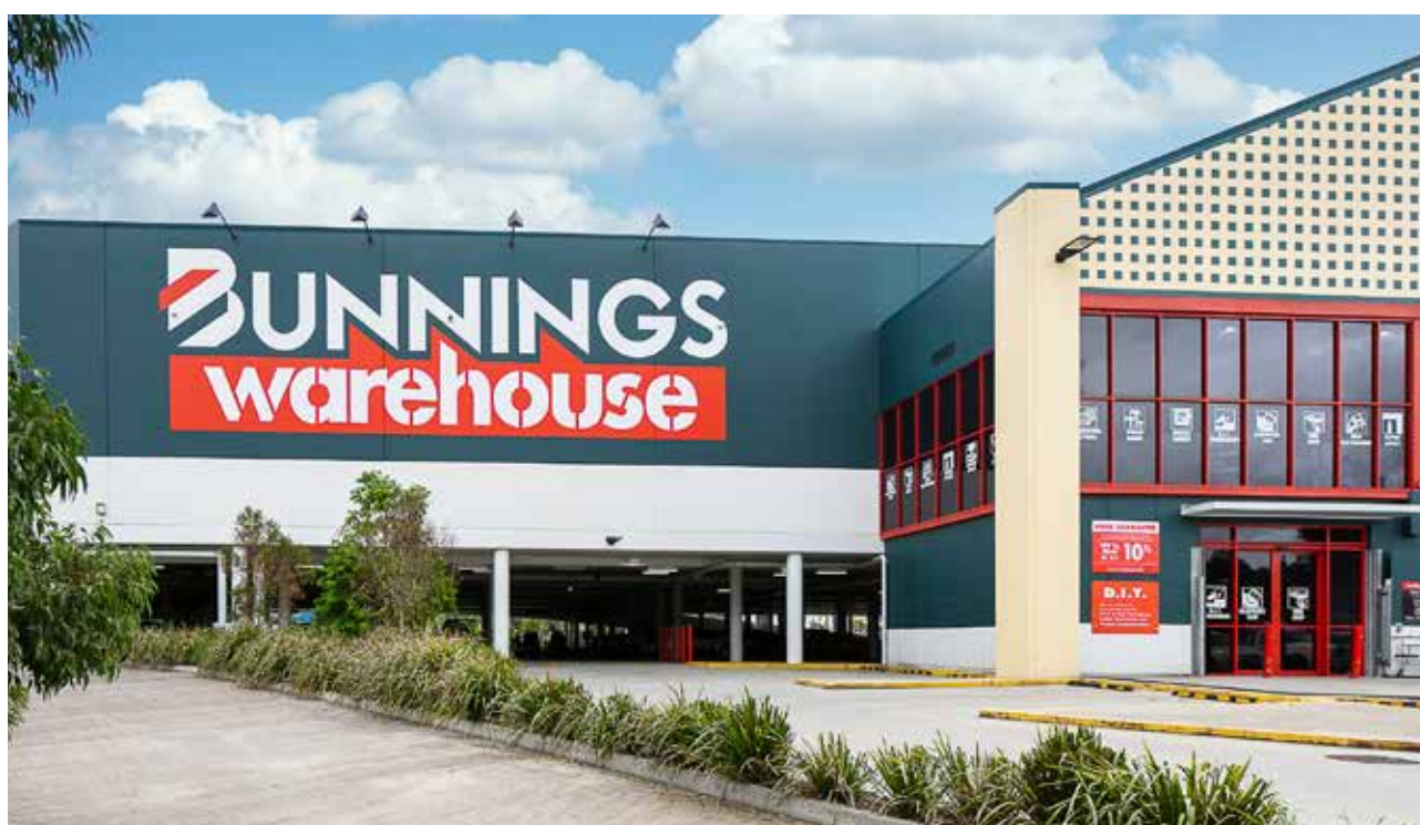
Bunnings Warehouse, Bundamba, QLD

A benchmark allocation of 80-90% of Trust gross assets will be allocated to property trusts that are predominantly managed by MPG.