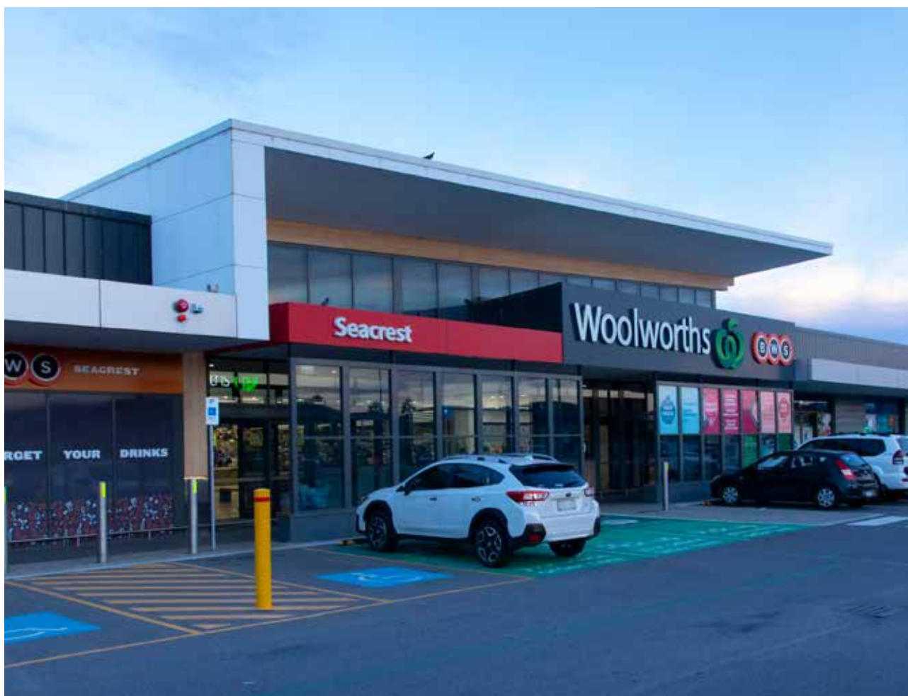
Seacrest Shopping Centre, Wandina WA - A property held in the MPG Retail Brands Property Trust