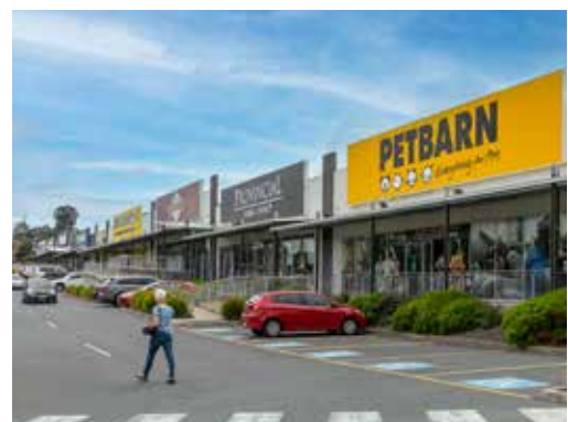
Chirside Homemaker Centre, Chirside Park VIC