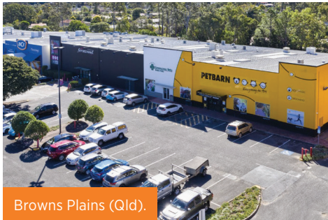
Browns Plains (Qld).