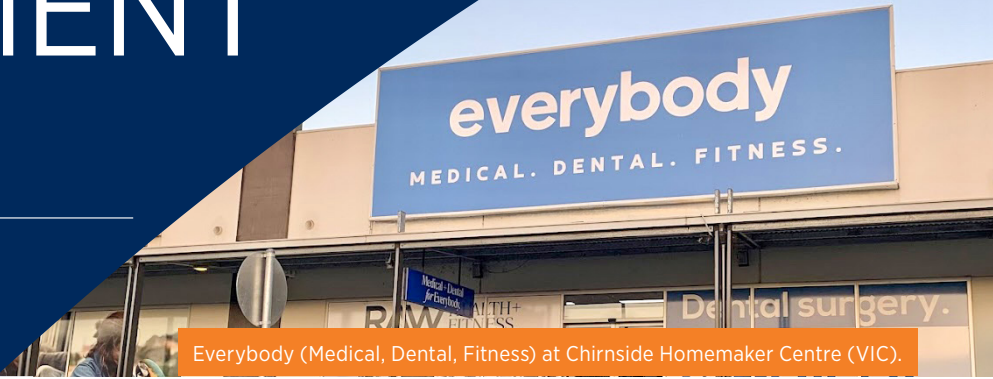
Everybody (Medical, Dental, Fitness) at Chirside Homemaker Centre (VIC).

MPG Bulky Goods Retail Trust ARSN: 105 947 199