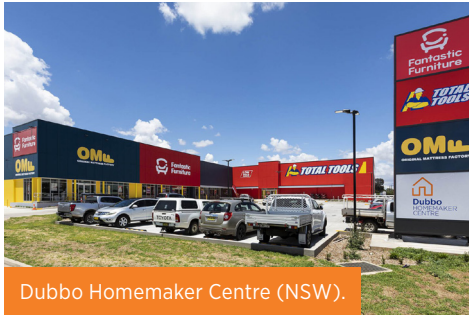
Dubbo Homemaker Centre (NSW).

The distribution for the December 2024 quarter will be 3.75 cents per unit. This is in line with the forecast return of 15.1 cents per unit for the financial year ending 30 June 2025, which provides a strong return in the current market.